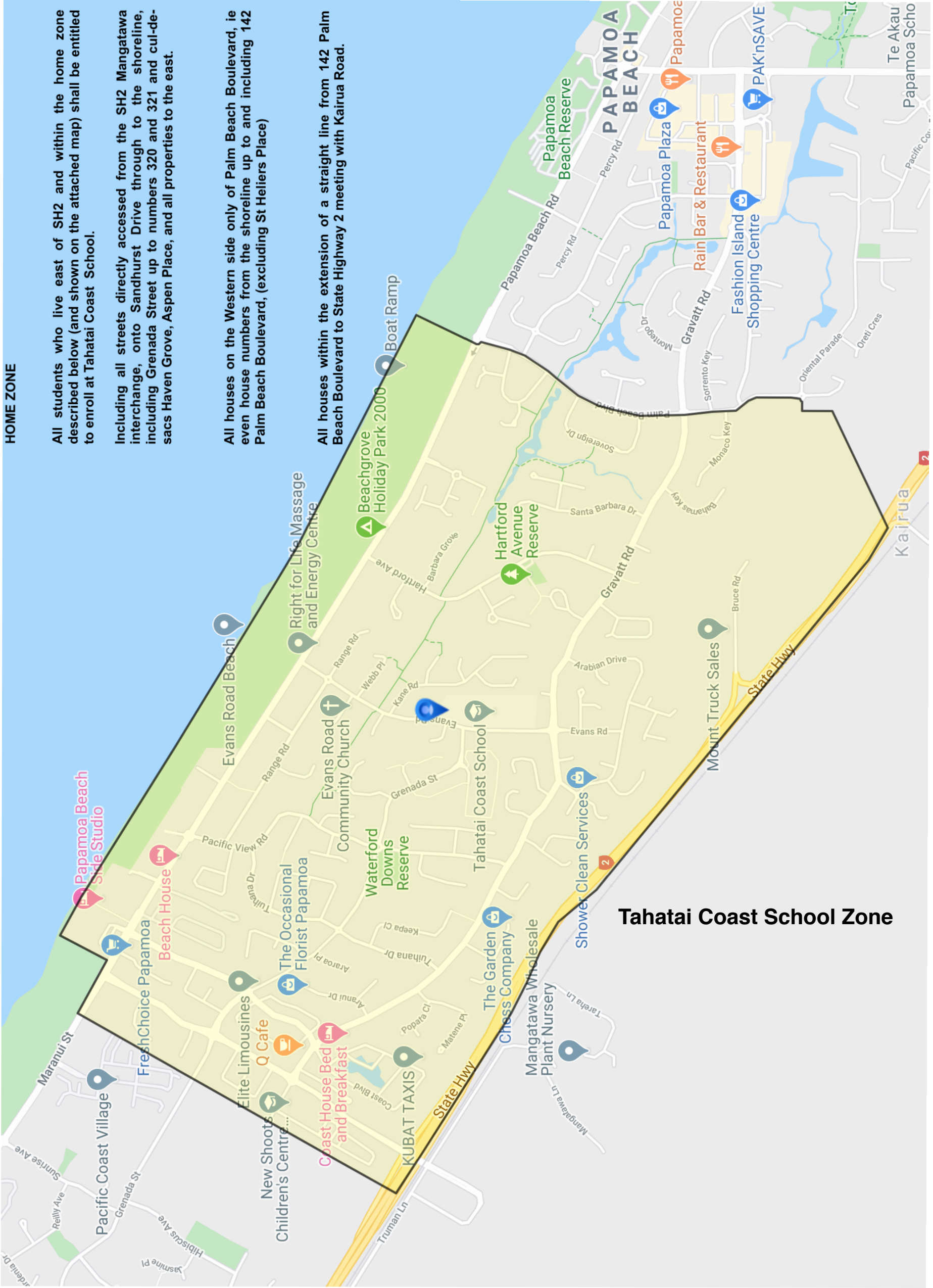
Tahatai Coast School Zone

All houses within the extension of a straight line from 142 Palm Beach Boulevard to State Highway 2 meeting with Kairua Road.